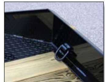
5K Lbs. D-Ring Tie Downs – Welded at both front corners of Air-Dam Bulkhead (optional).