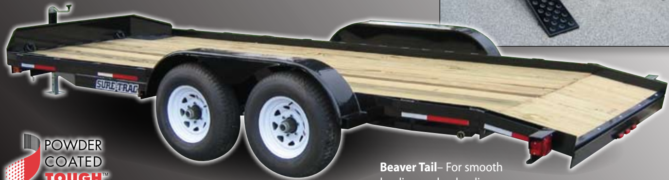
Beaver Tail – For smooth loading and unloading.