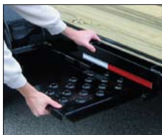
Slide in Ramps – Heavy duty, 5 ft. ramps fit neatly under the deck. Can be loaded from driver or passenger side.