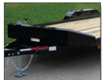
Optional Air-Dam Bulkhead – Provides better aerodynamics and helps protect cargo.