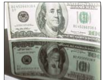
Powder Coated Finish – A durable high-gloss finish that will last for years.