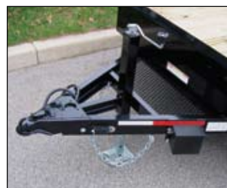
Optional Set-Back Tongue Jack – Clearance for tailgate and SUV rear doors with optional Mesh Open Tool Storage .