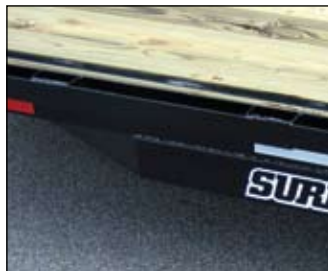
Wrap Around Tongue – Full 4 inch wrap on all trailers. Stake Pockets & Rub Rail are standard.