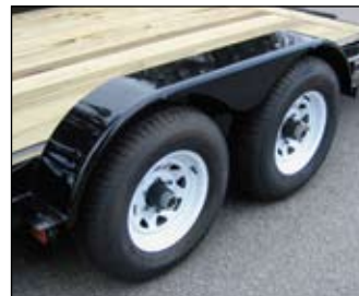
Teardrop Fenders – With backers allow for a clean ride and provide smooth good looks.