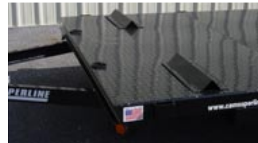
Adjustable Wheel Chocks